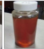
Oil sample AFTER oil filtration