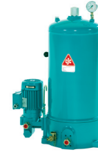
CJC® Oil Filter installed at the gearbox of the Banbury Mixer