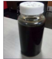
Oil sample BEFORE oil filtration