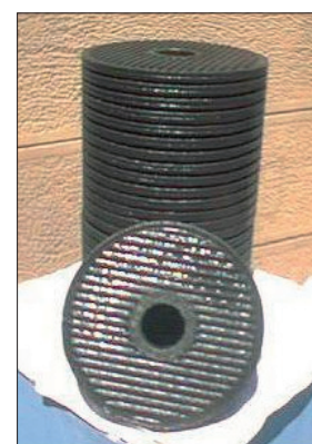
Used CJC™ Filter Insert Type B 27/27