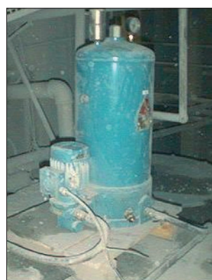
CJC™ Fine Filter HDU 27/54 P-Y