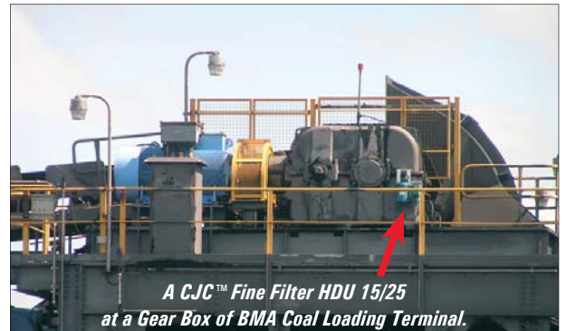
A CJC™ Fine Filter HDU 15/25 at a Gear Box of BMA Coal Loading Terminal.