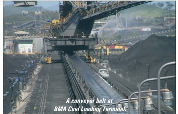
A conveyor belt at BMA Coal Loading Terminal.