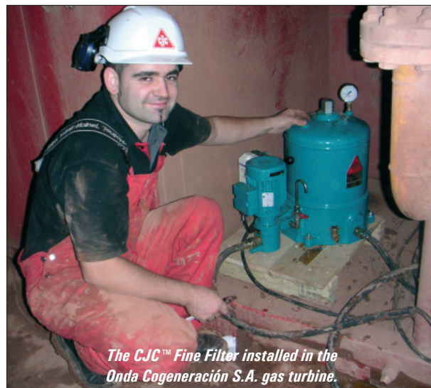
The CJC™ Fine Filter installed in the Onda Cogeneración S.A. gas turbine.

We now recommend a CJC™ Off-line Fine Filter as an optimal proactive maintenance solution to eliminate oxidation residues from oil, together with fine wear particles that pressure filters cannot retain.