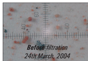
Before filtration 24th March, 2004