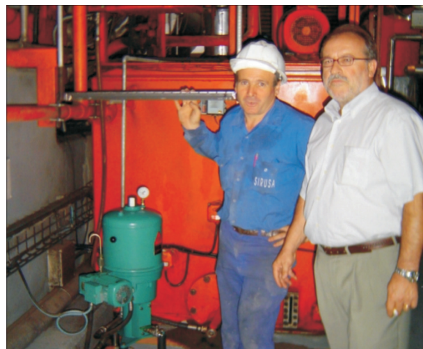
Installation of the CJC™ Filter Separator PTU2 27/27

Only one month after fitting the CJC™ Filter it was possible to reduce contamination from wear and tear particles by 70 times, and the probability of breakdown was reduced by a factor of 5. Water was reduced to 100 ppm. The results were succeeded with only one filter insert change per year.