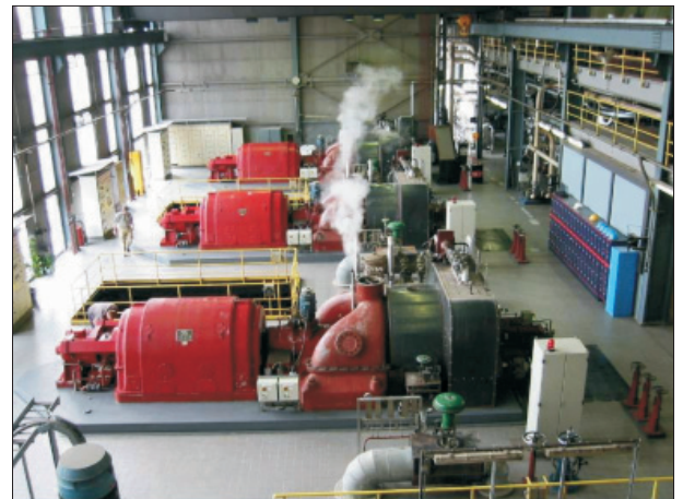
Steam Turbines at AVR Rotterdam

In 23 days a total of 22 litres of water have been separated from the oil which is measured by a measuring jug collecting water from the automatic water discharger.