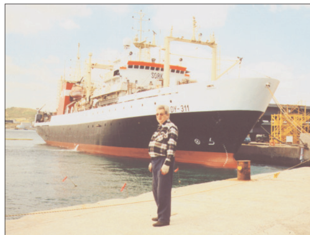
Fishing trawler and fish processing plant m/t "Ateria" in Gdynia Port.

During 10 months of filtration the oil has been cleaned from ISO 4406 21/20/17 to 15/14/9. After the oil has been cleaned the hydraulic system operates without problems and the vessel's engineers can concentrate on other problems.