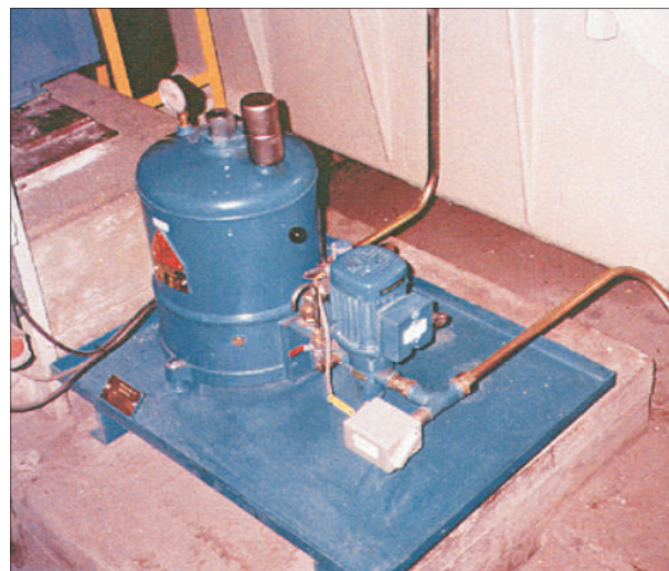
The Portland Rotating Oven is by FLS Gear equipped with a CJC™ Filter for retaining particle, oxidation and water from the gear oil.

The achieved reduction from 3,257,000 particles > 5 µm to 6,969 will increase the gear bearings life by a factor of five.