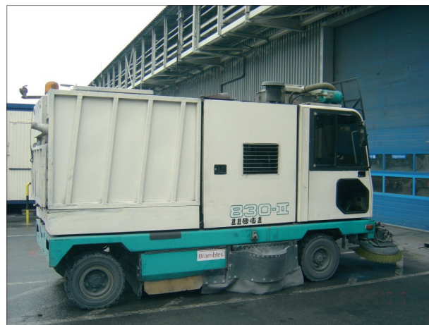
The Tennant Sentinel Street Sweeper.

Particle contamination has been tackled and ISO 16/14/11 cleanliness level was achieved within 797 running hours. The deterioration of the oil caused by resins has been arrested. The vehicle equipped with a CJC Filter is set to have an oil change after max. 5,000 hours. A longer service interval yields direct cost savings and more availability of the vehicle. Clean oil has extended the lifetime of the pumps, valves and hydro-motors.