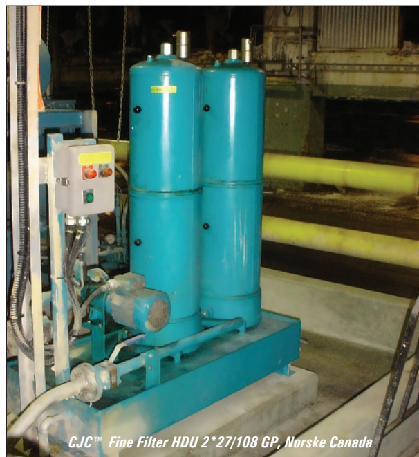
CJC™ Fine Filter HDU 2*27/108 GP, Norske Canada

The sample results show a dramatic improvement in the first three months; particulate levels dropped to 18/17/14 as the oil quality improved. The subsequent months show a more gradual improvement, highlighting CJC's ability to actually clean the inside surfaces of the lube oil system (valves, hoses, etc.) by circulating clean oil. The most recent laboratory results indicated an ISO code of 16/14/11, roughly 1/100th of the initial particle count.