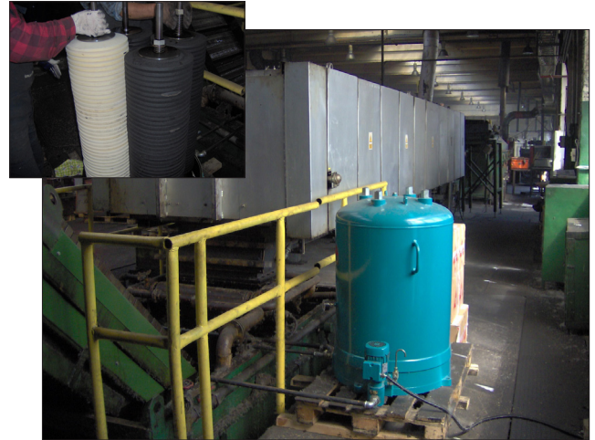
Replacement of the first CJC™ Filter Inserts

Cleaning of the heat exchanger was no longer needed. On the quench bath with the CJC™ Filter installed, unplanned stops and loss of production were reduced.