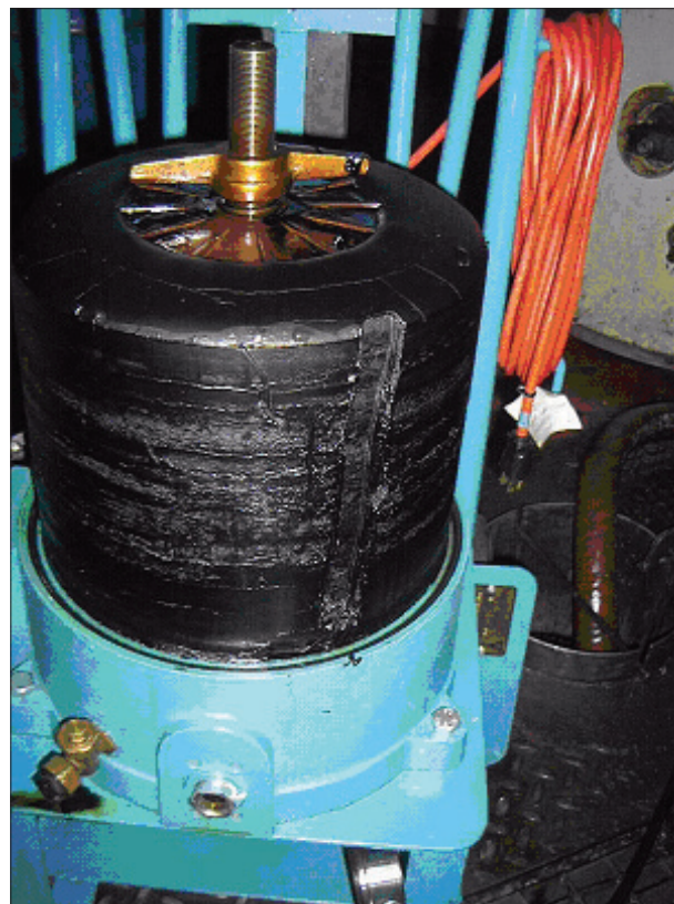
CJC™ Filter Insert A 27/27 - After test

As a result of the test, NSK purchased and installed a HDU 427/81 on the system.