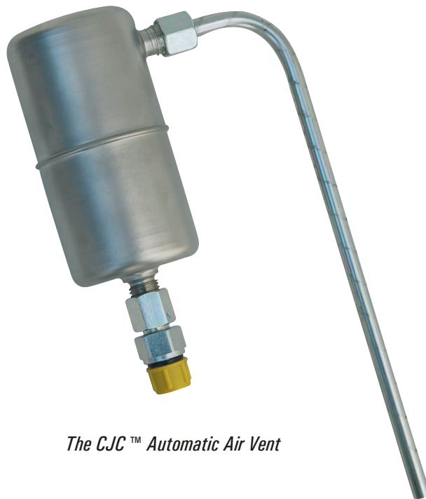
The CJC™ Automatic Air Vent