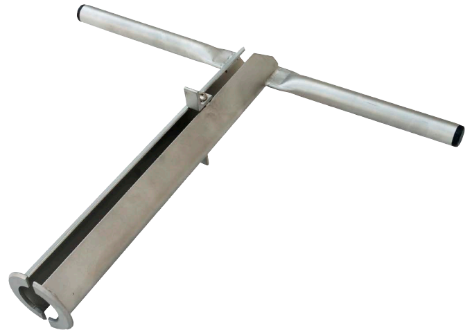
The CJC® Filter Insert Extractor