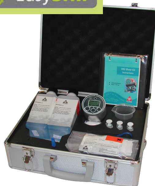
The Oil Analysis Kit CJC™ DIGI Water Kit EasySHIP

Contains the DIGI Cell, Reagents, Spare Parts and Instruction Manual.