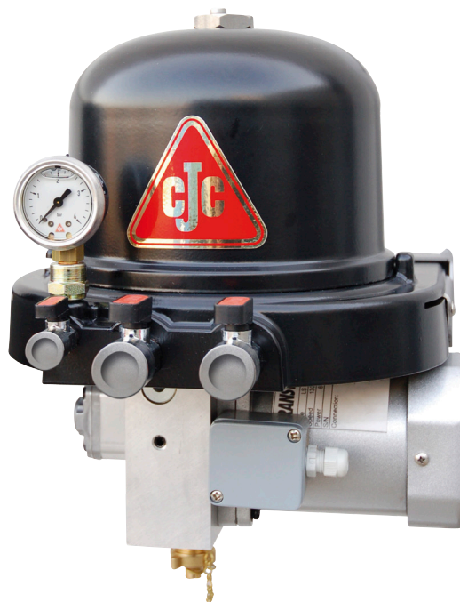
The CJC® Compact Offline Oil Filter HDU 15/12

The water absorption potential is up to 50% (i.e. 375 mL H 2 O) of the total contaminant holding capacity.