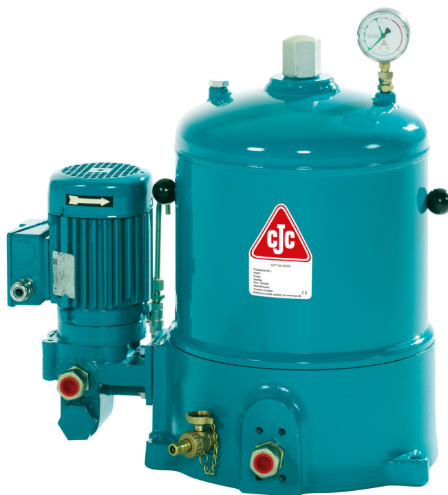
The CJC® Fine Filter HDU 27/27 P

The water absorption potential is up to 50% (i.e. 2,000-8,000 mL H 2 O) of the total contaminant holding capacity.