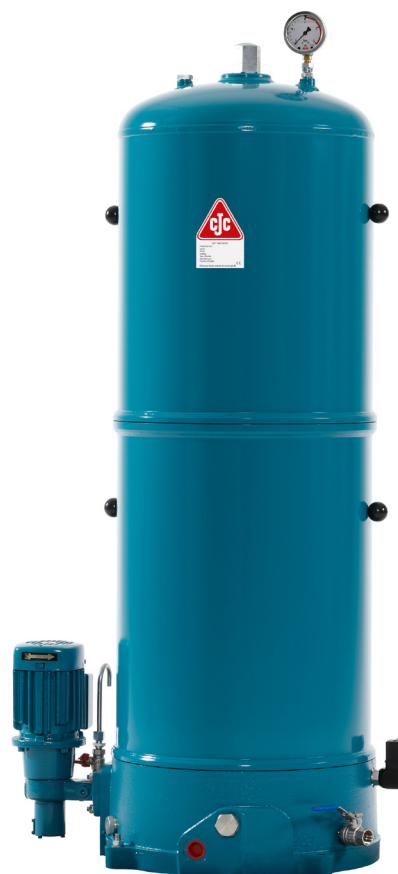
The CJC® Fine Filter HDU 38/100 PV

The water absorption potential is up to 50% (i.e. 3750-6250 mL H 2 O) of the total contaminant holding capacity.