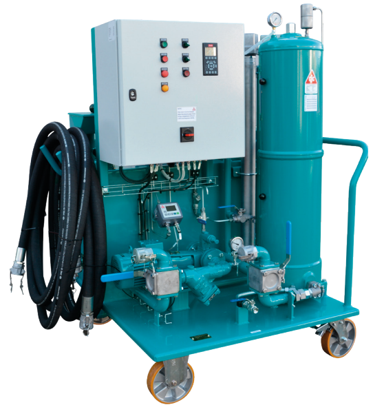
The CJC™ Mobile Flushing Unit, MFU HDU 27/108 GP