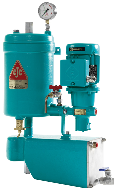
The CJC® Filter Separator PTU 15/25 PV

Consult C.C.JENSEN A/S for further information.